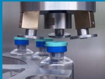
Crimp sealing option in multi- functional AMT™ Servo Monoblock

Automated Machine Technologies, Inc. 10404 Chapel Hill Road, Unit 100 Morrisville, NC 27560-1186