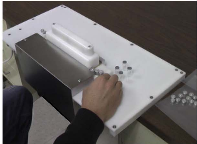
AMT™ Semi-Automatic Crimp Sealing

Office@AMTLiquidFilling.com www.AMTLiquidFilling.com Phone: (919) 361 0121 FAX: (919) 481 2120