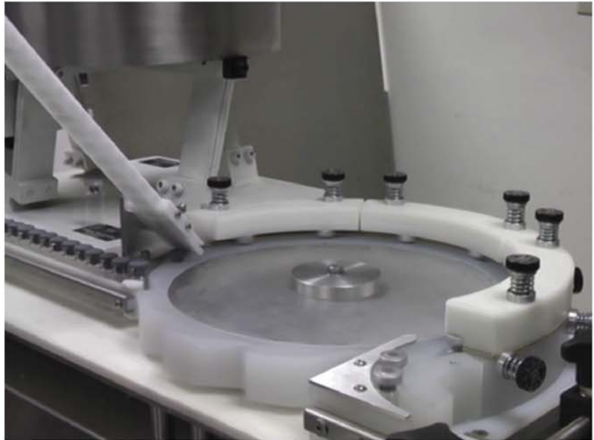
AMT™ Fully Automatic Crimp Sealing