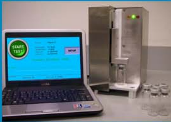
Non destructive and objective crimp seal tester